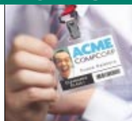
Item # 510 4.5" x 2.75" w

Made of a durable vinyl material, Gateway Safety badge holders protect your ID badge, proximity (proxy) card, driver's license or other forms of identification that don't have a pre-punched slot. Available in horizontal or vertical orientations.