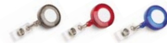
Item # 490 Black